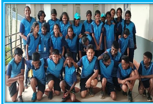
SSCAAT 4 th STATE VOLLEYBALL & THROWBALL COMPETITION - 2023 WINNERS & RUNNERS