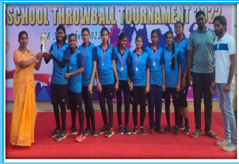
DAKSHIN SAHODAYA INTERSCHOOL THROWBALL U-19 WINNERS