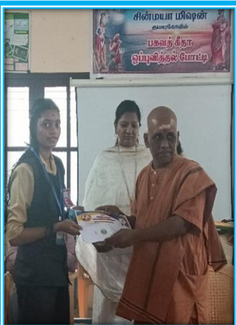
I - PRIZE BHAGAVATH GITA CHANTING COMPETITION