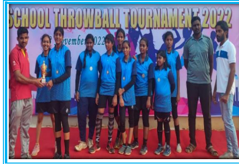
DAKSHIN SAHODAYA INTERSCHOOL THROWBALL U-17 RUNNERS