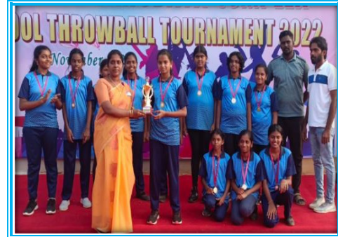
DAKSHIN SAHODAYA INTERSCHOOL THROWBALL U-14 WINNERS