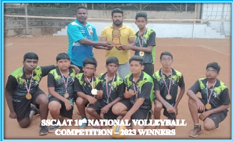
SSCAAT 10 th NATIONAL VOLLEYBALL COMPETITION - 2023 WINNERS