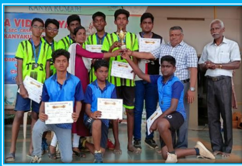
DAKSHIN SAHODAYA INTERSCHOOL VOLLEYBALL U-17 RUNNERS