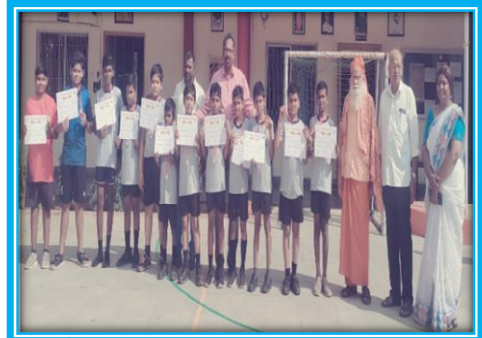
DAKSHIN SAHODAYA INTERSCHOOL ROLLBALL SKATING U-14 WINNERS