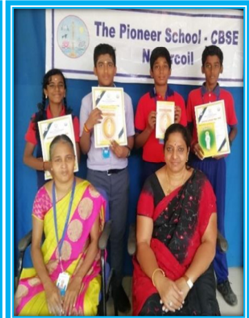
VALLALAR MUPPERUM VIZHAA DISTRICT LEVEL COMPETITION WINNERS