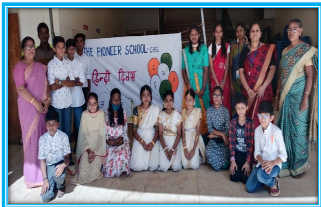
Promoting National Integration with Hindi Diwas