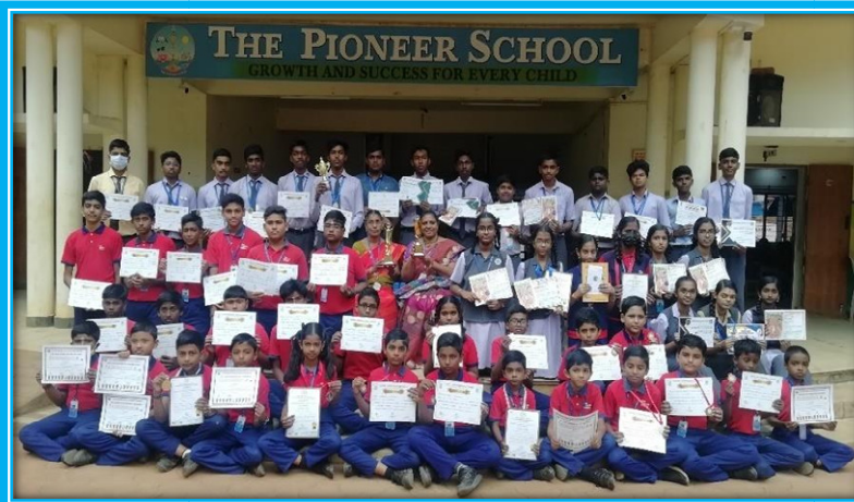
Prize Winners in various competitions